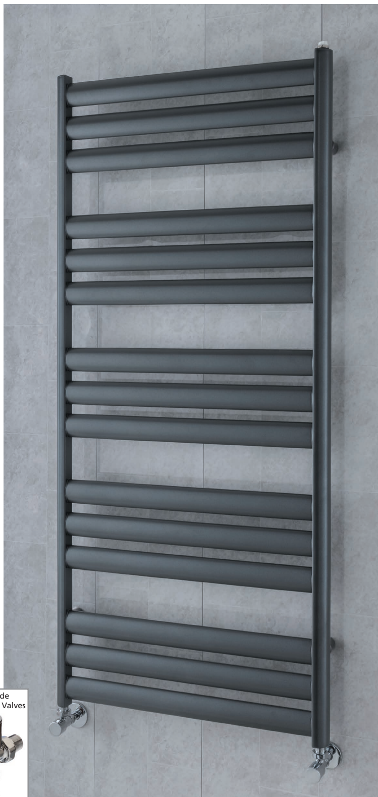
◆1340mm x 600mm shown in Gun Metal Grey with DRAKE valves.