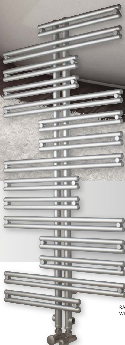
RAL 9006 White Aluminium

A striking and highly individual round tube radiator, KASAI demands to be noticed. It is a versatile choice and will make a strong addition to a bathroom or living space. It is available in selected RAL or metallic colour finishes to ensure that, whatever your décor, the KASAI will enhance your home.