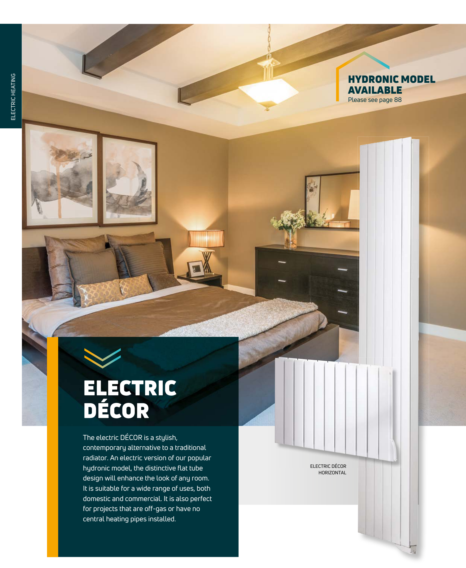
ELECTRIC DÉCOR VERTICAL