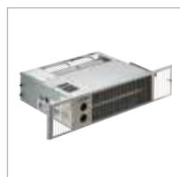
SS3, 5, 7, 9