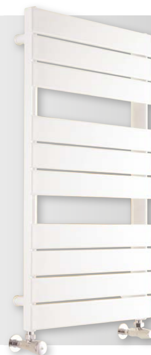
RAL 9016 Traffic White

INTERLUDE is a simple and elegant flat tube radiator. It is manufactured from quality steel and has a sleek and streamlined appearance. It is both practical and attractive and is available in selected RAL, metallic or special metallic finishes.