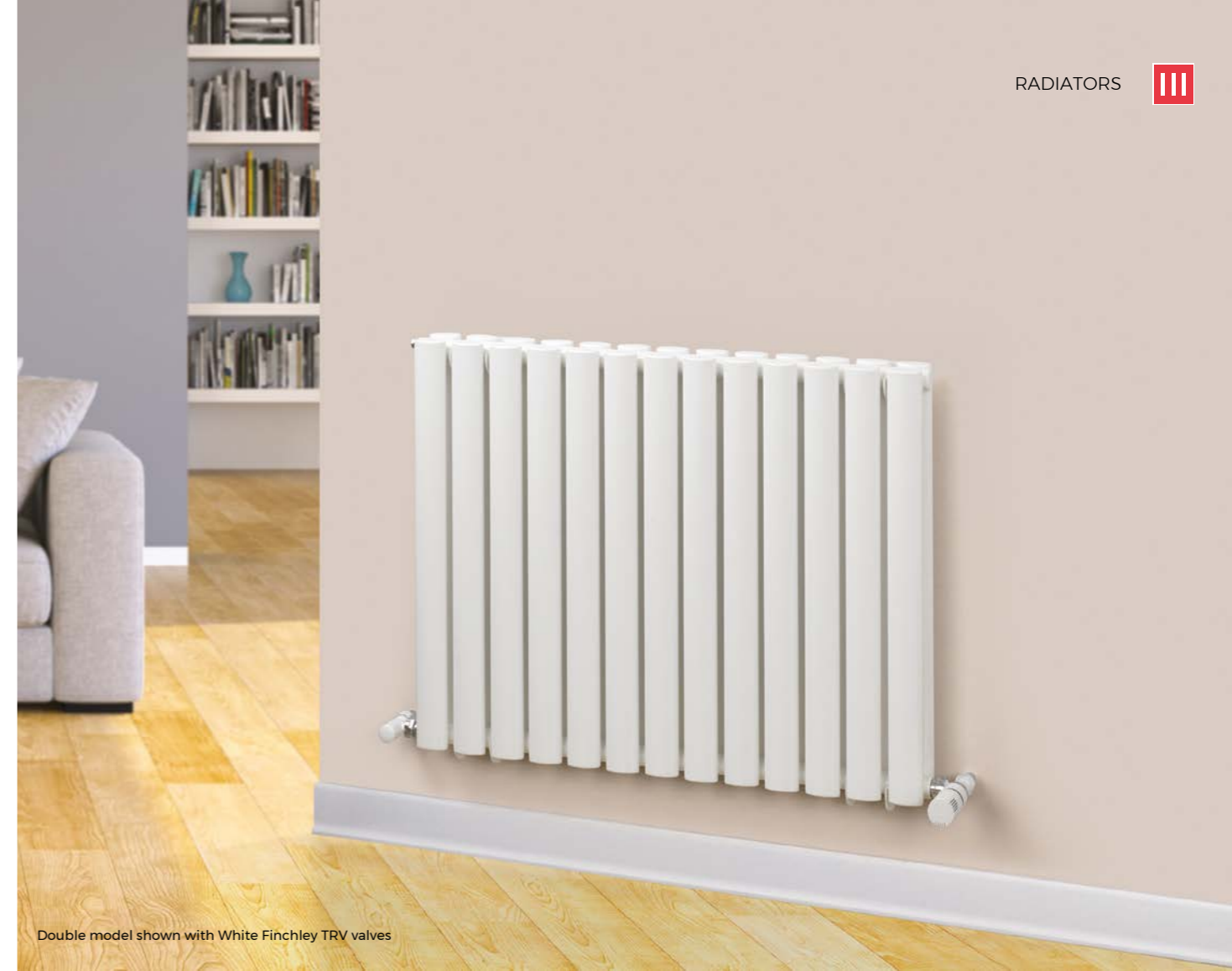
Double model shown with White Finchley TRV valves

If you would like a colour swatch please contact head office