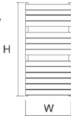
H120 - 14 tubes