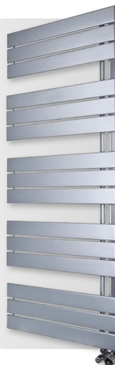
RAL 9006 White Aluminium

MARANOA has an attractive asymmetric design that uses blocks and spaces to create a distinctive appearance. The large flat tubes are both stylish and practical and, with left or right hand side mounting options, it offers flexibility in any project. MARANOA is available in selected RAL, metallic or special metallic finishes.