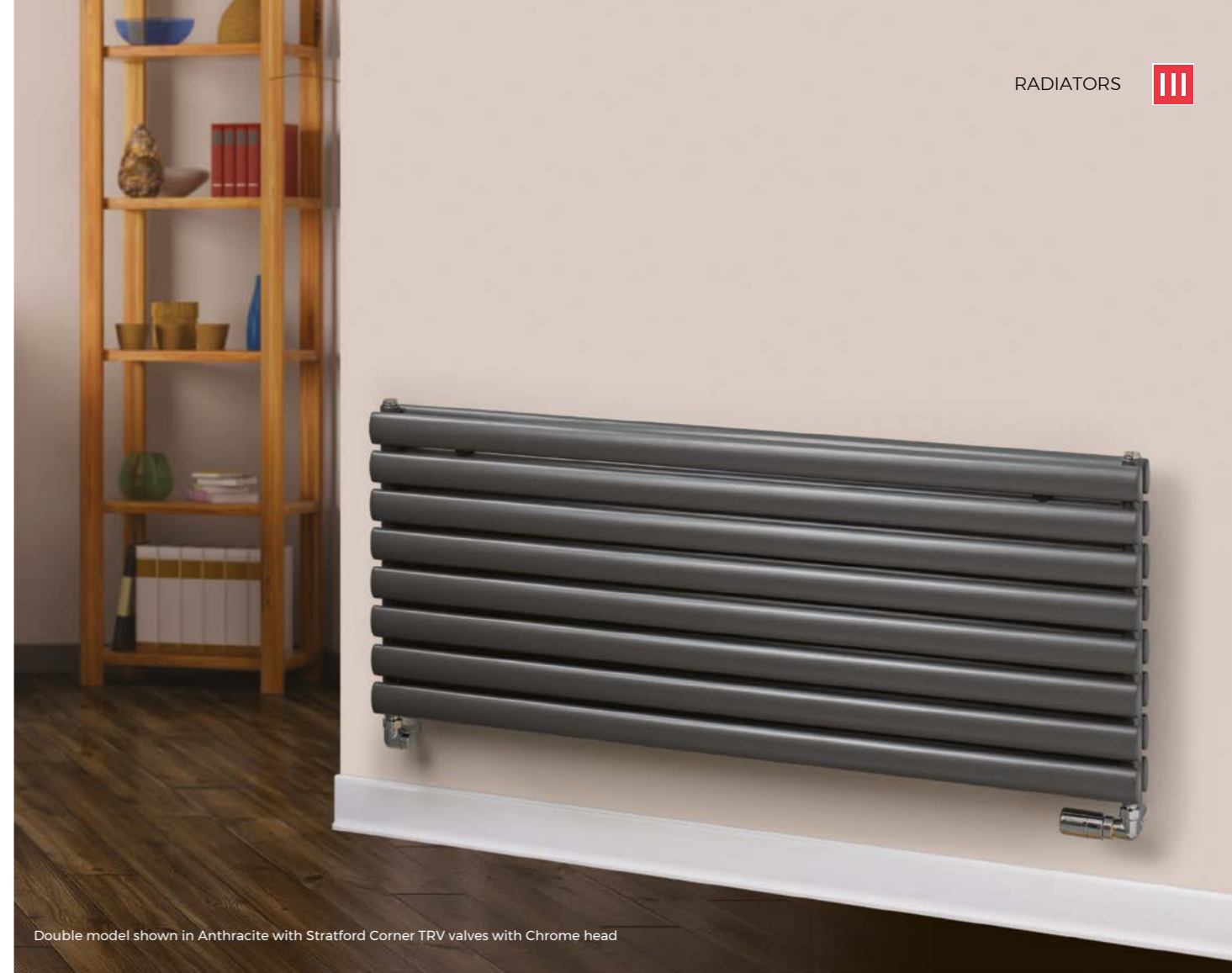
Double model shown in Anthracite with Stratford Corner TRV valves with Chrome head