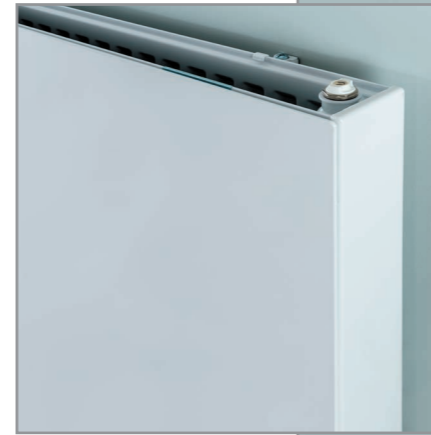
PANNELLO Type 21 (P+) Vertical profile

+Valves Prices include straight Chrome or White KINGSTON TRVs