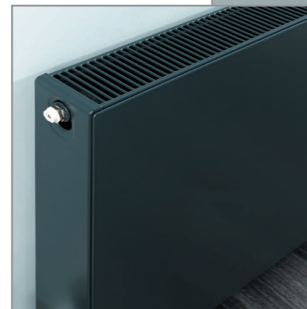
PANNELLO Type 22 (K2) in RAL 7016 Anthracite Grey

Pipe centres left to right = width minus 56mm or 50mm Pipe centres from wall = 65mm Depth from wall = 106mm